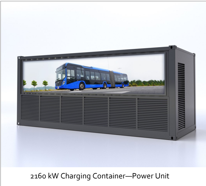
2160 kW Charging Container—Power Unit